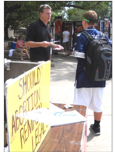
“Should Abortion Remain Legal” poll table at Wichita State with the small Exhibit in the background.

Giving our seminar attendees a local place to practice FEET WORK was lacking from our last seminar in 2009. This year, however, Justice For All, conducted our small exhibit and poll table outreach (pictured right) at Wichita State University (WSU) and we were pleased to be joined by eleven seminar participants.