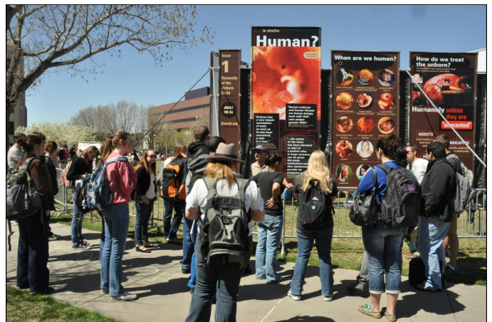
Students conversing with trained volunteers on the Auraria Campus

For the complete April 26, 2011 article, please find it on line at http://www.catholicnewsagency.com/news/abortion-debate-takes-center-stage-at-downtown-denver-campus/