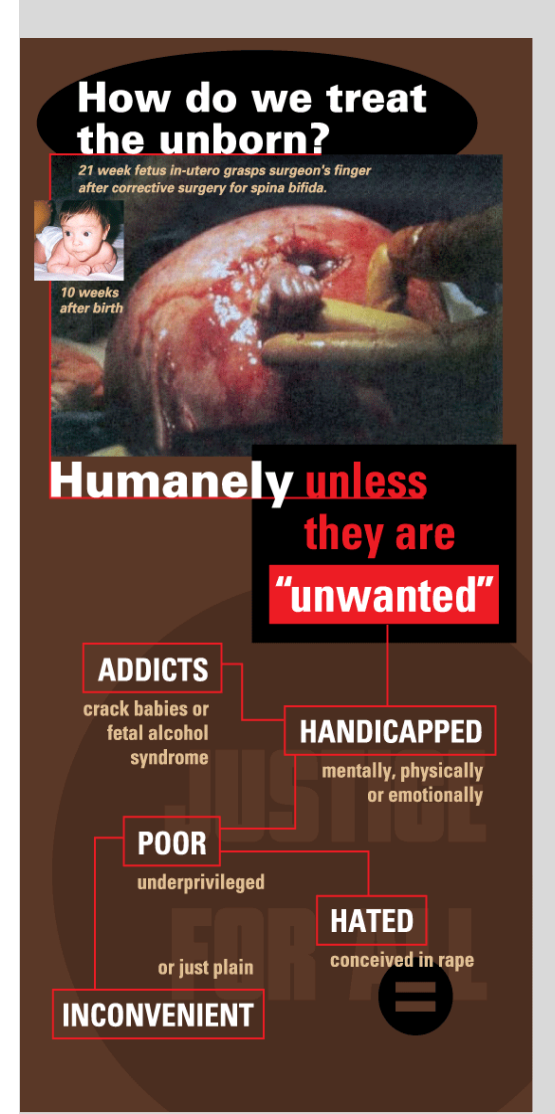
Exhibit Brochure, Page 4

little bit like the first doctor patient handshake!