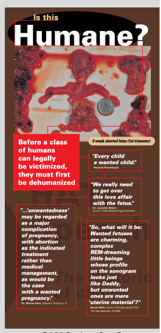
Exhibit Brochure, Page 5