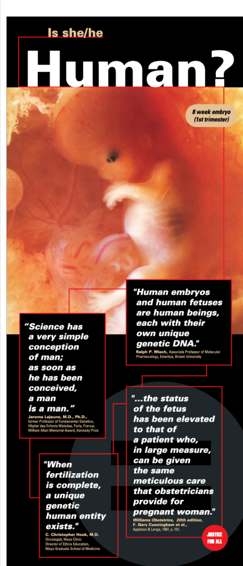
Exhibit Brochure, Page 2